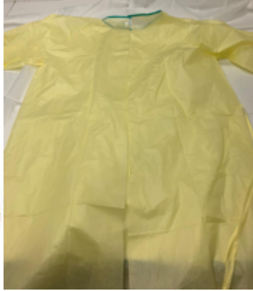
2.Inner package photo